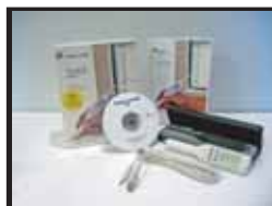
Scale-Link USB - Computer - Input Plan Scaler